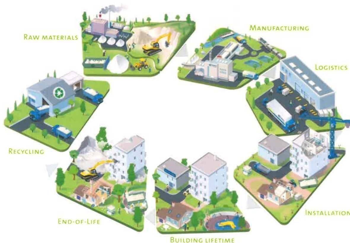
Flow diagram of the Life Cycle